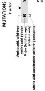
Figure 1. Mutations in HIV-1 that affect susceptibility to antiretroviral drugs, by HIV gene target. The letter above each position is the wild-type amino acid and the letter(s) below each position indicate the substitution(s) that are associated with drug resistance. Reprinted with permission from [6]. Detailed user notes and regular updates are available at the International AIDS Society—USA Web site [7]. FDA, Food and Drug Administration.